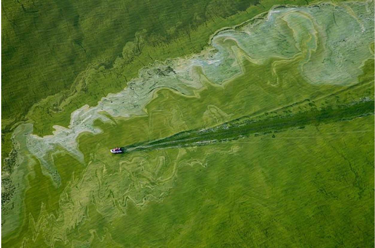
Figure 2: Aerial photograph of the cyanobacterial bloom in Western Lake Erie.

The Center at Bowling Green State University (BGSU) has received funding for five years (2018-2023) from the Centers for Oceans and Human Health 3: Impacts of Climate Change on Oceans and Great Lakes program (COHH3). Support is for research and facilities operations and community engagement activities that build on robust academic and agency partnerships that have developed in the wake of the 2014 Toledo Water Crisis (Fig. 3).