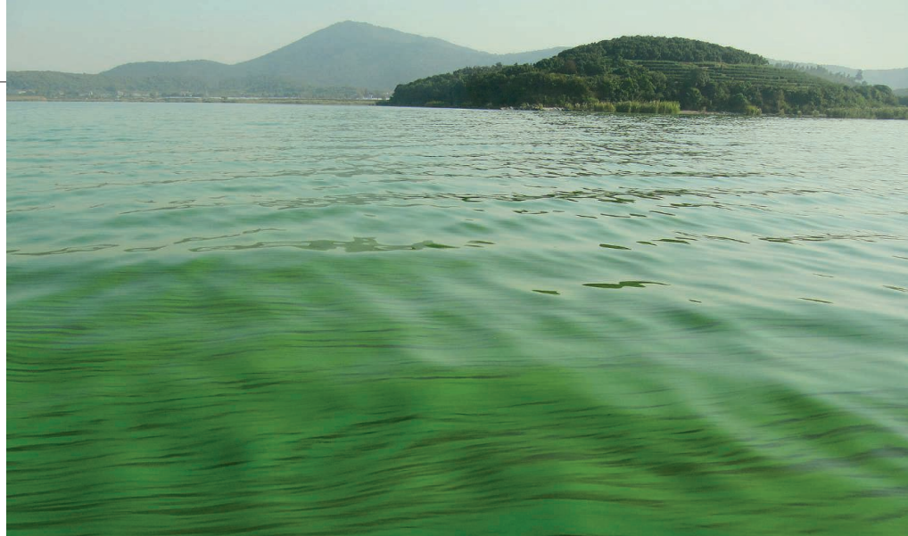
Bloom of the toxic, non-N 2 -fixing cyanobacteria Microcystis spp. in eutrophic Lake Tai, China.

New nutrient reduction strategies should incorporate point and non-point sources, including N removal in wastewaters, optimization of fertilizer application, and erosion controls. This