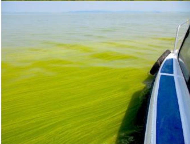
Close-up photograph of Microcystis spp.-dominated cyanobacterial bloom in Lake Taihu, photographed by P.I. Hans Paerl during July, 2018