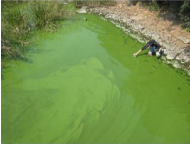
Shoreline Microcystis spp.-bloom in Lake Taihu, during June, 2015