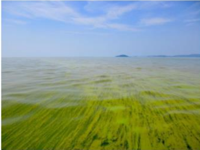
Microcystis spp.-dominated cyanobacterial bloom in Lake Taihu, photographed by P.I. Hans Paerl during July, 2018